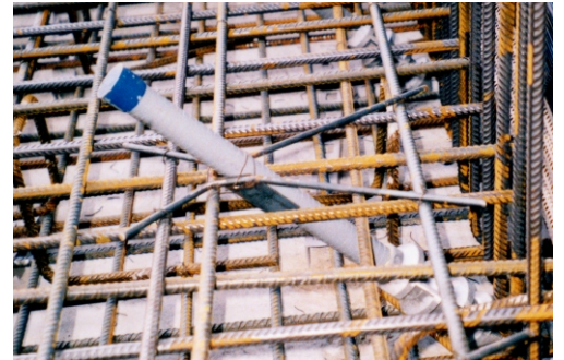
"Hercules" EsB with Holder 45°

perm. load P 45° / concrete pressure property : 275 kN / 18 N/mm 2 - 290 kN / 20 N/mm 2 - 325 kN / 25 N/mm 2