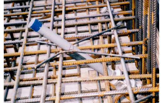
"Hercules" EsB with Holder 45°

perm. load P 45° / concrete pressure property : 275 kN / 18 N/mm 2 - 290 kN / 20 N/mm 2 - 325 kN / 25 N/mm 2